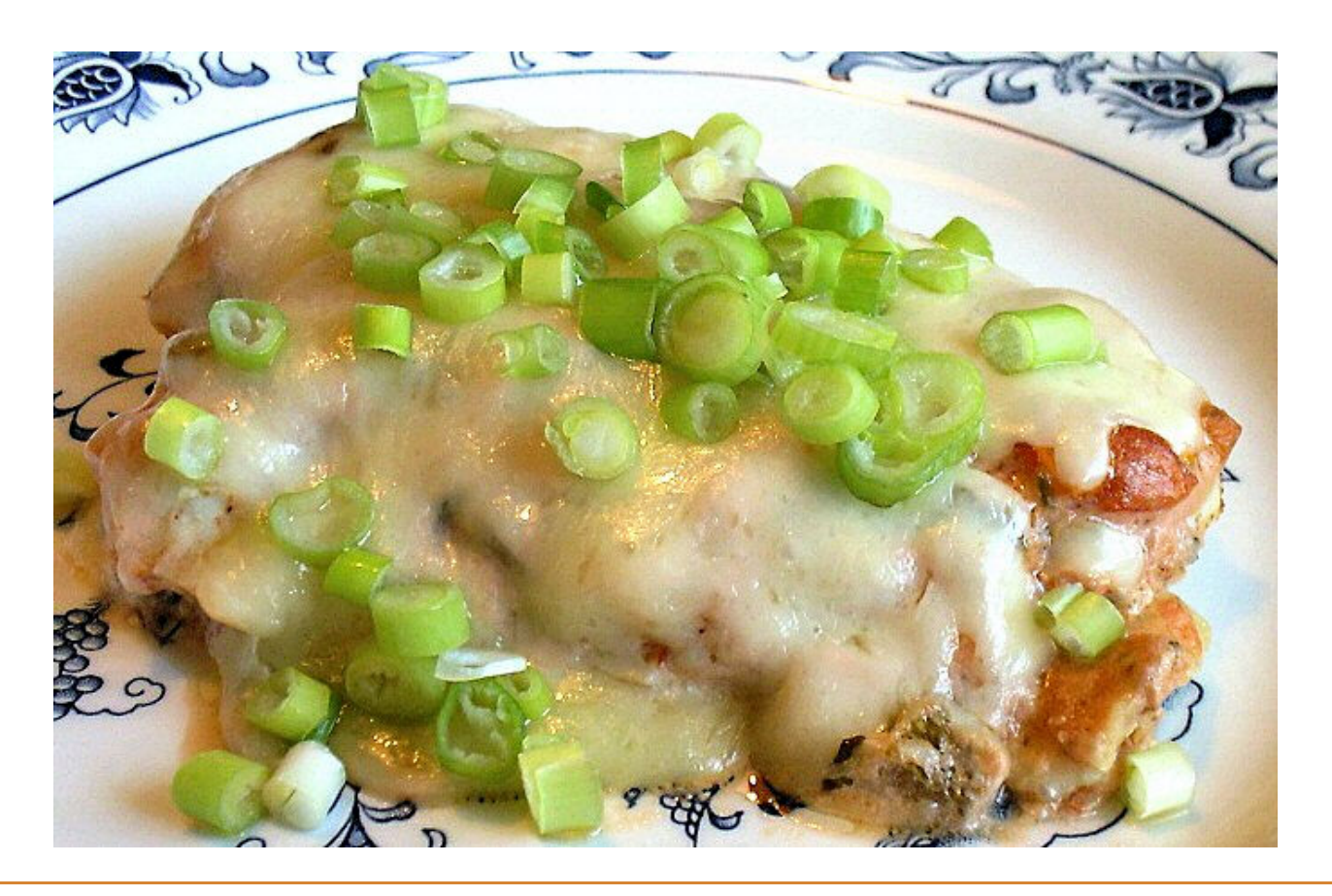
From Linda's Low Carb Recipes & Menus - https://www.genaw.com/lowcarb/

Sprinkle both sides of the chicken with taco seasoning. Pan fry or grill the chicken; place in a greased baking dish. Mix the salsa and sour cream; pour over the chicken. Bake at 350° for 20 minutes or until fully cooked. Top with the cheese and bake for a few minutes to melt the cheese. Garnish with green onions.